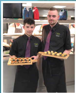
Celebrating Visitor Economy Week 2019