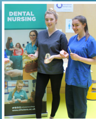
Healthcare Sciences Skills Show 2019