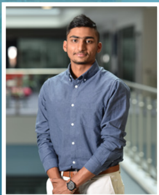
Blazing a Trail with Apprenticeships