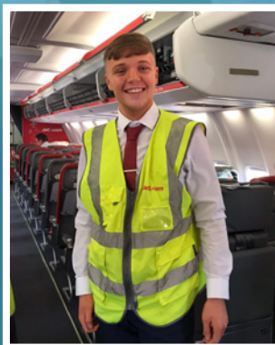
An Adventure with Jet2.com