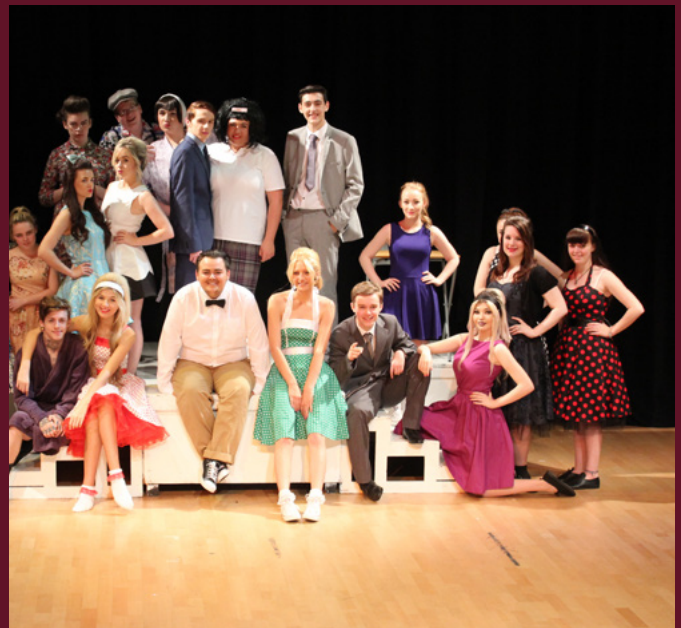
She travelled back to the 60s in Hairspray