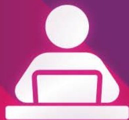
Personal Development Tutor