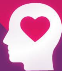
Safeguarding, Mental Health & Wellbeing